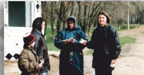
Autumn outreaches 1996