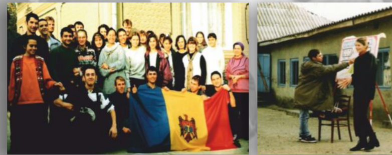
First national missions training & outreach

Challenge into Missions is a ten-week training course that takes place twice a year. The participants - mainly young Moldovans - learn about the basics of faith and evangelism and put these into practice in outreaches in Moldovan villages.