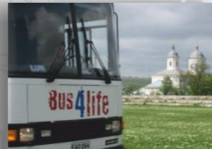
Bus4Life in Moldova

B4T offers business training on different levels and subjects as well as small loans and ongoing consultation, so Moldovans can start and run their own business, providing for their families and creating work for others in the community.