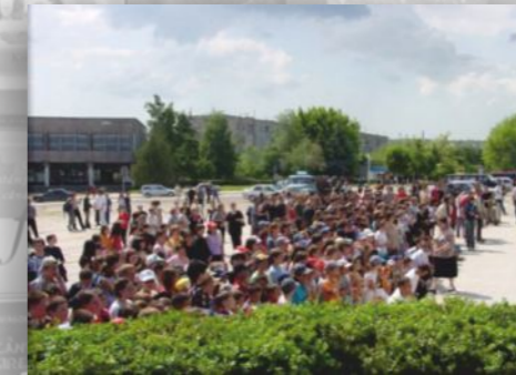
Kids' Games in Telenești

Smaller teams are living in different parts of the country, working together with the local churches in serving the communities.