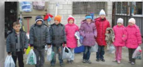
Winter clothes for children

Seasonal projects seek to cover needs as they arise, like providing school supplies in autumn or firewood, food and clothes in winter.