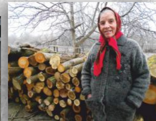
Firewood for the winter