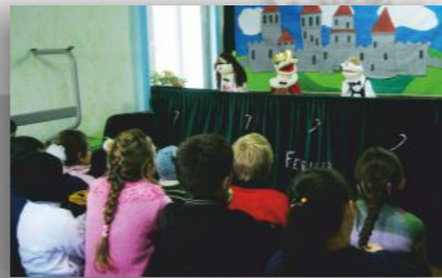
Puppet show at a Day Centre

Holding conferences for girls at risk from our Day Centres and cooperating with other organisations, we try to help those most vulnerable to protect themselves against exploitation.