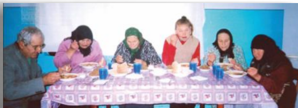
First Elderly Care project

These two years saw the Relief & Development ministries really take off with the opening of the first Day Centre and Elderly Care project, women's groups, the first business courses & loans and the building of the first playgrounds.