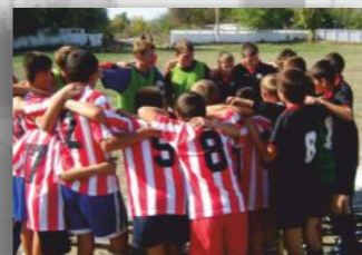
First church-based football teams

The Bus4Life visits Moldova several times a year, being used for street evangelism, children's programmes and as a mobile bookshop, café or cinema.