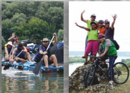
'Love Moldova' River Adventure & Cycling

About two thirds of our team are Moldovans. We are passionate about recruiting and training Moldovans for ministry and leadership, as well as helping churches learn what it means to send and support a missionary.