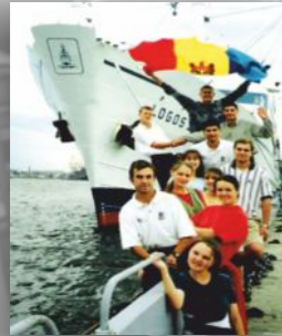
CiM students at the Logos II

The early team worked with the local churches in Nisporeni, also doing ministry in the nearby villages of Miclăușeni, Vânător and Soltanești. This period saw a growth in the literature ministry, aid and development projects and short term outreaches. In 2000 the ministry reached a turning point, marked by the move to Chișinău and a new focus on motivating and equipping national believers for evangelism and world mission.