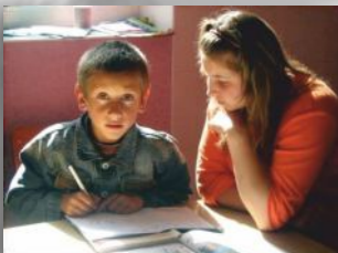
First Day Centre for children