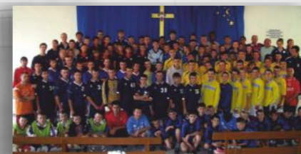
First football camp

Local believers train football teams, investing in these boys. We train the trainers and organise camps and championships. Besides these, sports festivals or table tennis tournaments are organised in communities.