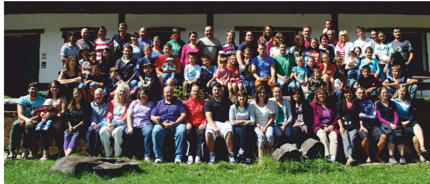
(Team picture summer 2014)