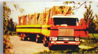
Truck used for smuggling Bibles

In the 1970s and 80s OM smuggled Bibles and Christian literature into the Soviet Union, of which Moldova was a part. The communist regime suppressed the Christian faith, but an OM team based in Vienna used specially adapted trucks to bring Bibles into the country in secret.