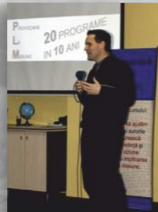
Challenge into Missions 10-year-anniversary

Every summer young people from all over the world experience missions first-hand, using various means to reach out to the people in Moldovan villages.