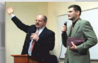
Opening of the Mission Centre

2008 first Christian football camp start of Local Ministry Team in Rezina first DELTA programme ("A year for God") Bus4Life in Moldova for the first time seven Elderly Care projects provide daily meals for 70 elderly & 10 Day Centres care for 185 children. opening of the church building in Paicu