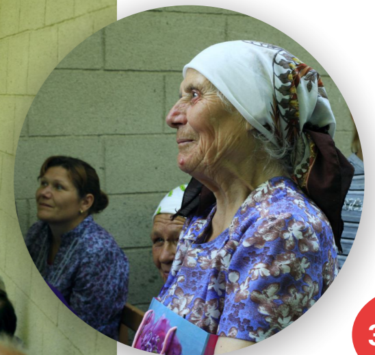
a ‘Love Moldova’ team doing outreach in Cobileia, Juli 2019